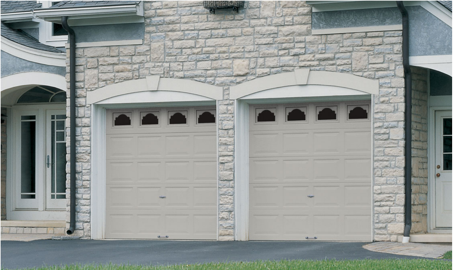
Model 8100 shown in Colonial design with Cathedral I window inserts